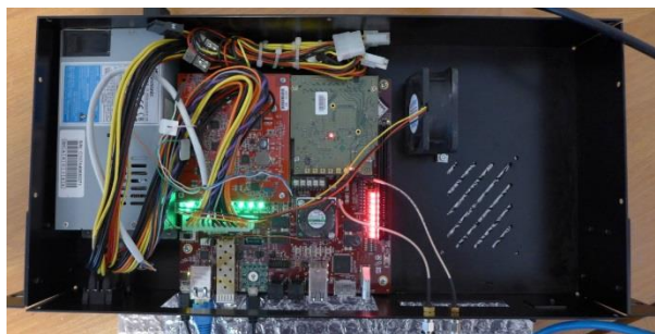
Fig. 1. Upgraded DNG@NCBJ digital acquisition system in a 19" case.

The upgrade of this system is divided into two parts. The digital board with the FPGA is replaced with a Mini ITX form factor board, see Fig. 1. A standard computer form factor allows a 19" size compact instrument to be built, ready to be mounted in a larger infrastructure. An Avnet AES-Mini-ITX-7Z045-G evaluation board was selected [2]. Both the architecture and specification of this board (FPGA part number, available memory, FMC connector, communication standards) are compatible with the previous board. This allows us to move all the IP cores and software between boards with only small changes in the board definitions files. Several scripts were added to simplify the measurement process. An option to use the Linaro Linux distribution with access to install software using a precompiled packet software data base instead of embedded Linux was added.